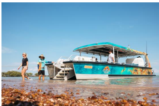
boat entry exit